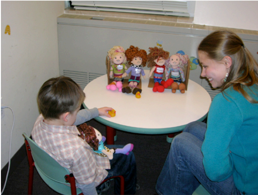
Fig. 1. Photograph of study set-up. Participant was seated holding the protagonist with four recipient dolls in front of him/her. The relationships between the protagonist and recipients were described to participants and they were given resources to distribute to these recipient dolls.